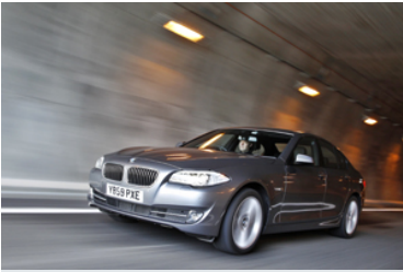
Bigger grille and more contoured styling create a handsome machine

With close to five million models sold over a lifespan that's already encompassed 38 years, and chart topping sales in its sector for the past four consecutive years, there's no doubt the 5 Series is the executive saloon of many company car drivers' dreams.