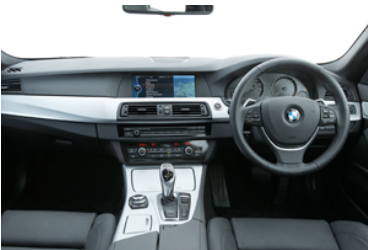
All 5 Series models have the latest iDrive information system

However, the 5 stacks up impressively well on performance and refinement against current rivals, including the Mercedes E-class and ageing Audi A6. It also beats them both on reliability and owner satisfaction, according to the 2009 Which? Car survey .